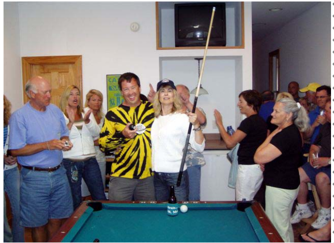
Winners of the pool tournament.