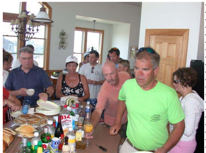
Is it pancakes yet? serving line in Monkey's beach house at Guy's Friday morning pancake breakfast.