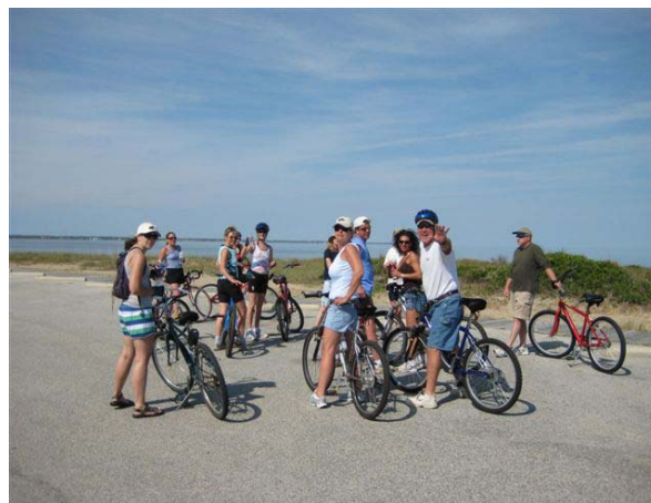
Where did you say that lighthouse was?