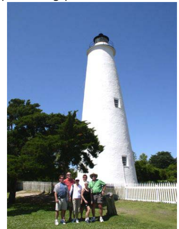
Our intrepid bicycle explorers visit the Ocracoke lighthouse.