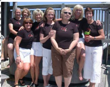
Beautiful weather, plenty of sun, and mucho food at the brunch hosted by no other than the ladies of MAMA Tease! Well, done, ladies. You did the Spirit of OBX proud!