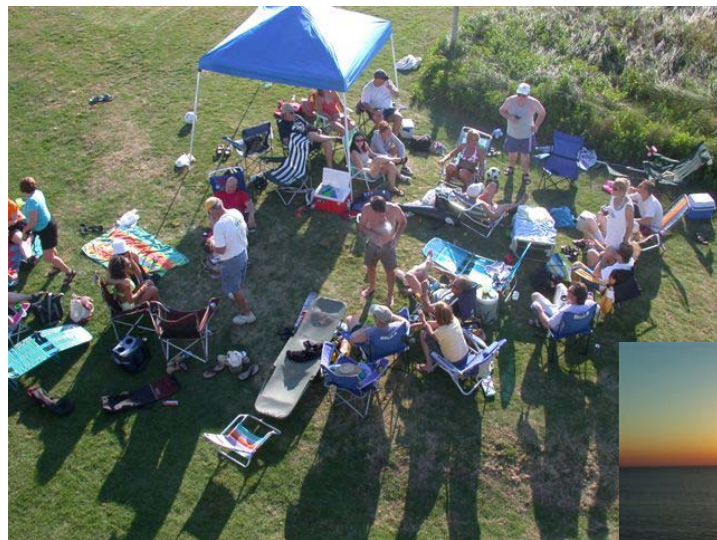
Party on the sound side.